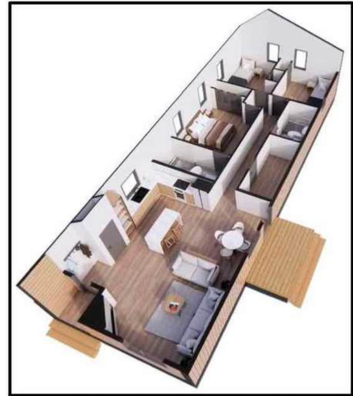
THREE BEDROOM-2 BATH 1096 SQ. FT.